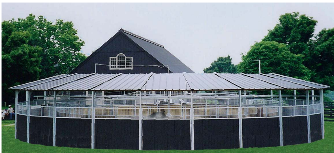
Overbrook-Farm, Lexington, Kentucky (USA). Partial metal roof

Uwe Kraft Reitsportgeräte & Metallbau GmbH