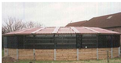
Bartolini Racing Stables, Mortroux, Belgium. Partial roof with corrugated concrete fiber roof