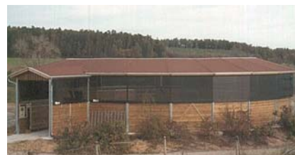
Phillip Retirement Stables, Neuhausen, Germany. Partial roof with corrugated bitumen roof, covered entry and wind net